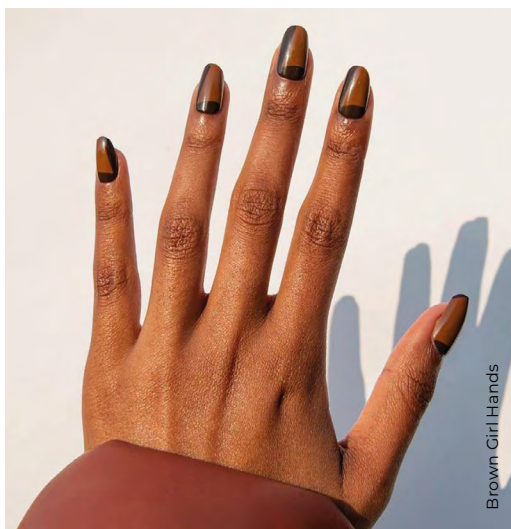
Brown Girl Hands